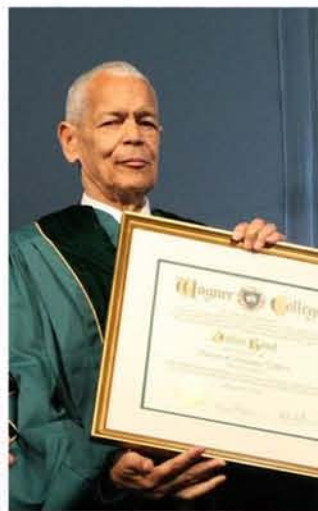
Julian Bond was the ceremony's keynote speaker.