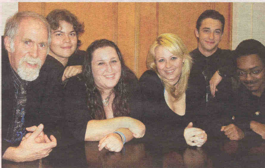
Stretto, a chamber vocal ensemble, performs Sunday.